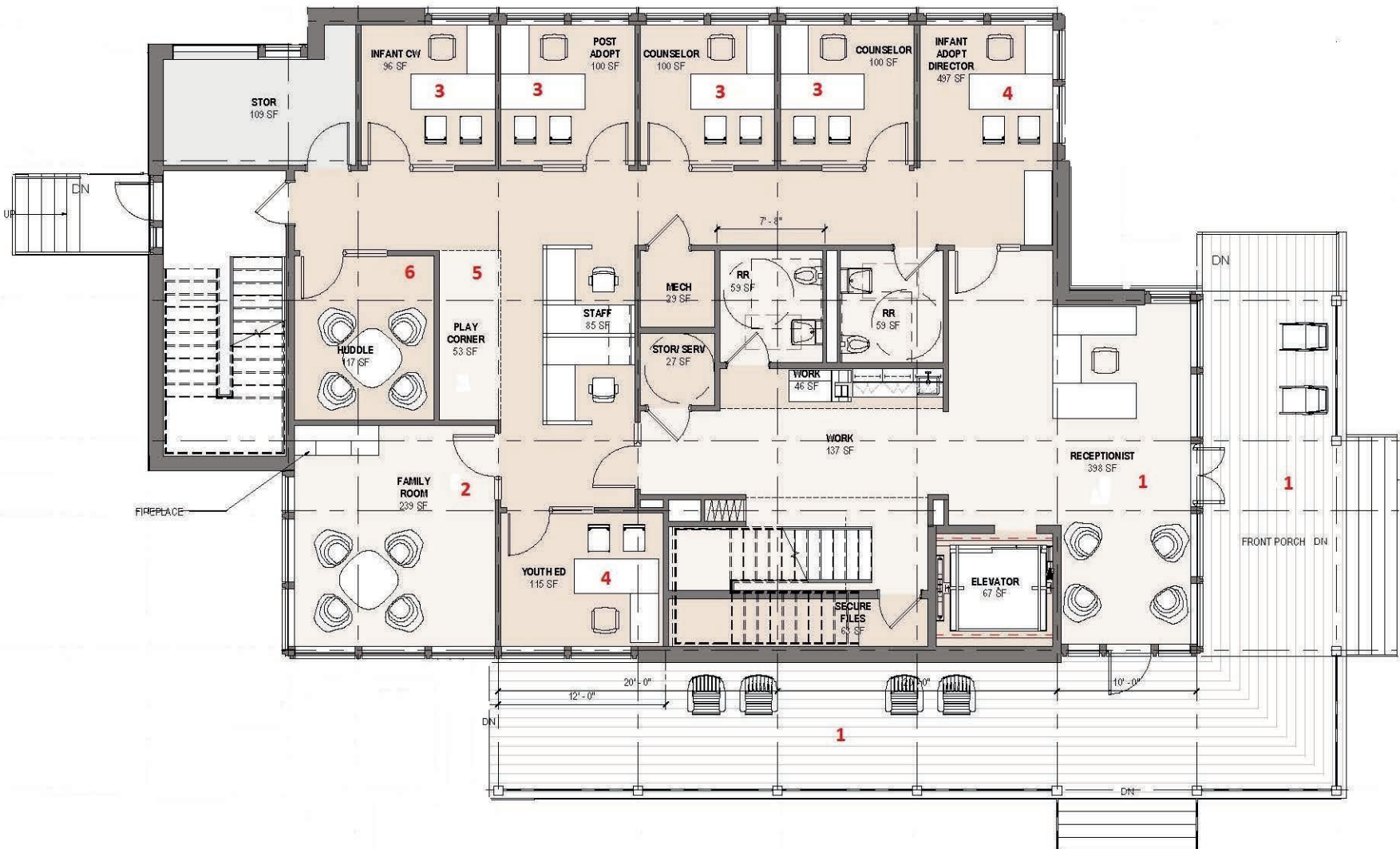
LEVEL 1 PLAN